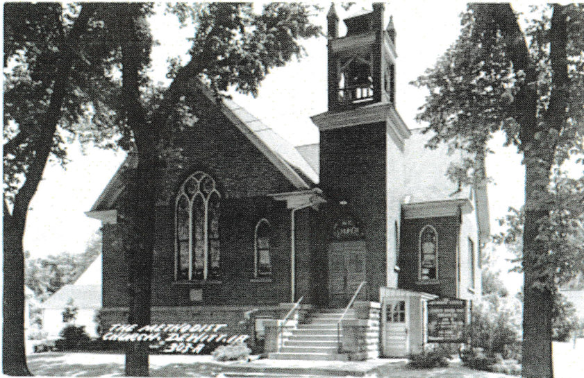
3rd Church- in 900 block of 5th Ave. Used from 1910 to 1959

After the condemnation of the church's building in 1907, it was clear that a new structure was required.